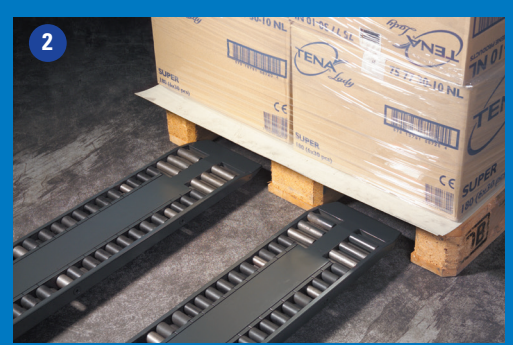
lf used as a pair, normal pallets can also be transported.