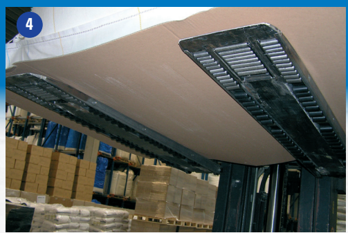
During transportation the load is fixed on the forks.