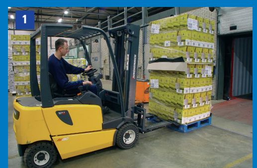
RollerForks® easily fit every lift truck.

RollerForks® can be fitted to the most forklift trucks with a FEM fork carrier including lightweight electric stackers. Products in boxes and cartons, bagged goods, FIBC's etc can be transported with RollerForks® when placed on a slipsheet. Since there are no hydraulics and lubrications required, the RollerForks® are particularly well suited to the food, the chemical, the consumer goods, the beverages and pharmaceutical industries. It is also possible to place a load with slipsheet on a standard pallet for in house transport and storage.