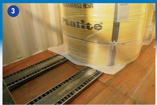
Lifting up goods directly from the floor